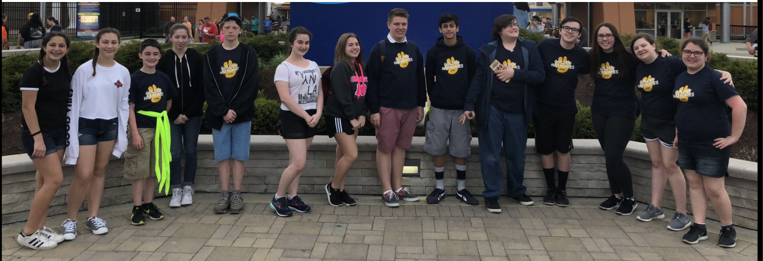
OFMS's Golden Harmonies received Gold (the highest rating) at the Spring Music Festival at Cedar Point.

The 8th Grade Chamber Ensemble not only received a Superior rating, this group was the only Class A choir at contest to received straight 1's!