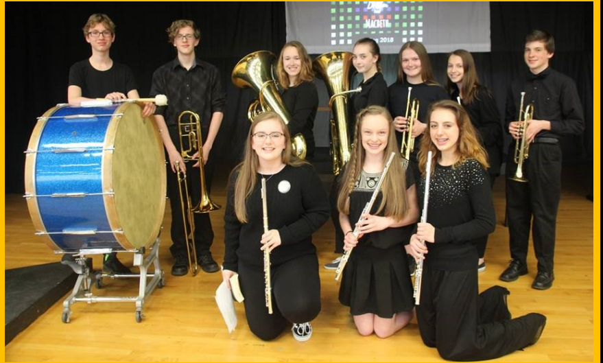
OFMS Pit Orchestra