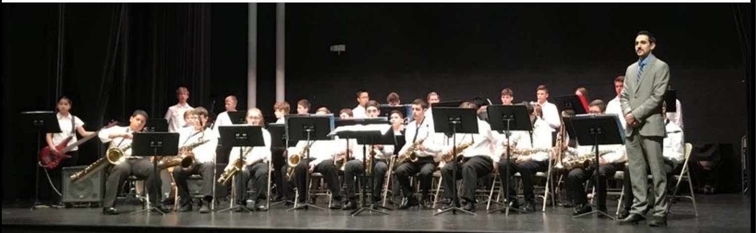
OFMS's Jazz Band received Superior rating and 1st place at Music In the Parks festival sponsored by Cedar Point.